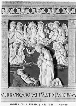
Della Robbia, La Verna, Italy

From Francis’ own writings and from the biographies written by Thomas of Celano and by St. Bonaventure, we can glean two important themes that flowed from this experience and shaped Francis’ understanding of what it means to be a human person.