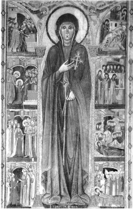
Dossal of St. Clare. Santa Chiara, Assisi

human, Clare shows a way of engaged and respectful human living. Beginning with the self-confidence of one beloved of God, and a respectful courtly bow to all of creation, Clare shows us a life marked by true deference, love and equal regard for others, the fruits of which are sensitivity, unity and harmony.