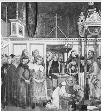
Giotto — Assisi — Greccio

Francis organized the first living Nativity scene in the town of Greccio to help people see, in real life and in their own time and place, what the love of God looks like and the extent to which God would get to restore human dignity (1C84-6). In the scene, we see the generous love of God made concrete, but also the marvelous capacity of humanity — even an unsophisticated baby — to communicate that love. Like a parent who out of love freely chooses to suffer with or for a child so that the child might grow and be empowered to come to full maturity, so too God chose to love humanity into life.