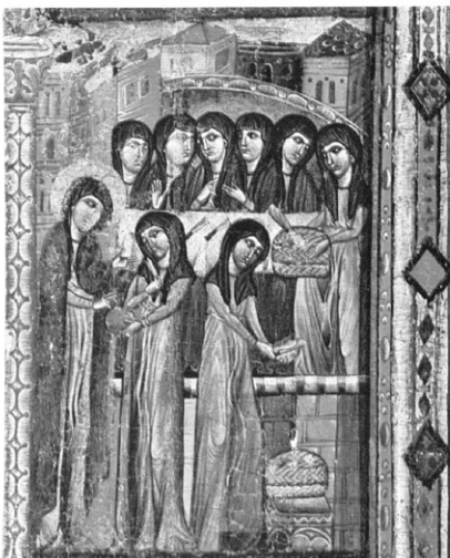
Dossal of St. Clare, Santa Chiara, Assisi

Unfortunately, there are very few works written by Clare’s hand, but we do have several letters and some documents related to the founding of the Poor Ladies (also called Poor Clares or Order of St. Clare). Through these documents we can see how Clare understood human beings, how she saw herself in relationship with others and what she expected of people, especially her sisters. Like Francis, Clare regarded human life as sacred because of the Incarnation — the great love of God displayed in the Passion of Christ. She recognized the deep communion that the Eucharist celebrates between God and human persons and human persons with their neighbors and all of creation. Yet, Clare lived out these beliefs in her own unique way together with her sisters.