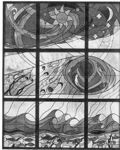
Australia stained glass window: Canticle

Bonaventure clearly places humans in an intimate relationship with the created world. At the level of the imagination, the world outside ourselves impacts our consciousness through our senses — touch, taste, smell, hearing and sight — and we make judgments about what we experience. Bonaventure held that, because God created all things, we could know something about God by experiencing the created world.