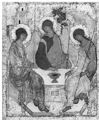
Rublev icon of Trinity

Scotus shows how the life of the Trinity provides a model for unity and mutual love. The Subtle Doctor holds Trinitarian life in mutual relationship as a foundational model for relationships between God, creatures, humans with one another, and between the divine and humans as co-creators and redeemers of the world.