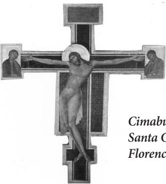
Cimabue. Santa Croce, Florence

FIRST , Francis was thoroughly enamored of the profound humility of God, demonstrated in the Incarnation—God taking on humanness and living among us. (1C 84)